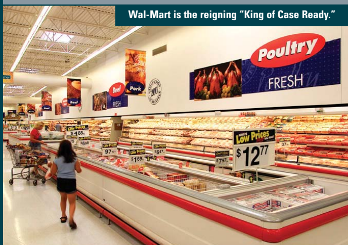
Wal-Mart is the reigning “King of Case Ready.”

How do American Foods Group case-ready products differ from the competition?